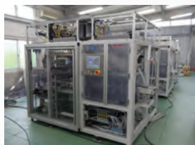
Polisher and washer