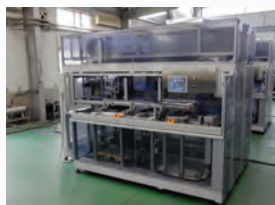
Attaching equipment